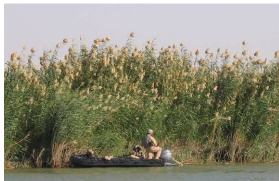
Diver Searching Euphrates River

The 3 rd ID, MND-C, Missing and Captured (MISCAP) Cell gathered significant intelligence that the Soldiers had been deposited Southwest of Baghdad, on or around Salman Island, a 750m x 150m swampy marshland on the east side of the Euphrates River. Due to the water depths and marshy environment, MND-C requested the 7 th Engineer Dive Team to conduct the search.