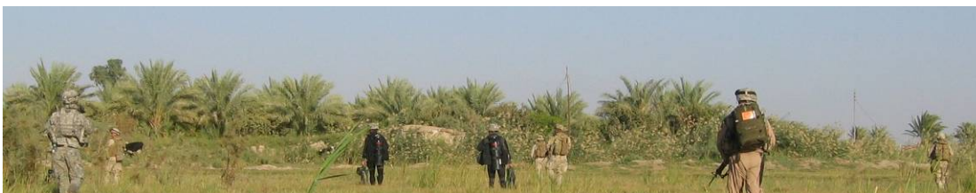
Divers Patrol into Salman Island to Search for MISCAP Soldiers

The 3 rd ID, MND-C, Missing and Captured (MISCAP) Cell gathered significant intelligence that the Soldiers had been deposited Southwest of Baghdad, on or around Salman Island, a 750m x 150m swampy marshland on the east side of the Euphrates River. Due to the water depths and marshy environment, MND-C requested the 7 th Engineer Dive Team to conduct the search.