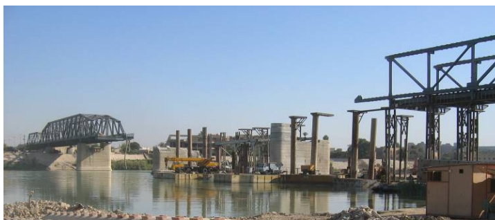
The Sarafiyah Bridge as of 28 NOV 08

The bridge linked Sunni and Shiite communities, and its loss devastated the Iraqi people. The Iraqi Ministry of Construction & Housing set the reconstruction of the Sarafiyah Bridge as the nation's number one bridge priority. However, their inability to break apart and remove the section of the bridge that was submerged in the Tigris River was significantly delaying their progress. LTG Odierno, MNC-I's Commanding General, felt it was in MNC-I's best interest to TACON the 7 th Engineer Dive Team to MND-B in order to demolish the underwater section of the Sarafiyah Bridge.