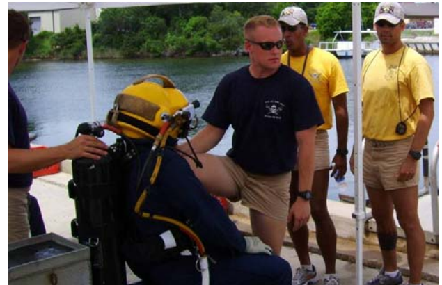
Students prep for dive during U/W construction phase of training

October was a great month in which we saw