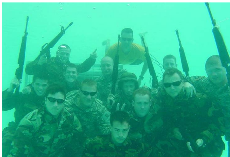
07-30-A2C/UCTB Grad Picture

our future as the temperatures continue to linger around 75 degrees.