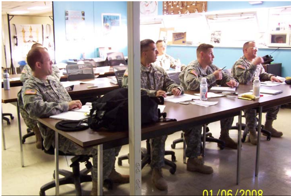
National Guard during Prescreen

Other sources of members for our team are likely to be prior service soldiers who are interested in becoming divers, or civilians who want to be divers but don't want to pay for commercial dive school.