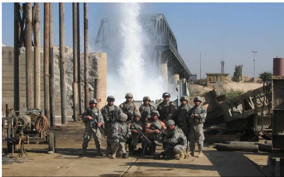
The 7 th Engineer Dive Team During Its Final (15 th ) Detonation at The Sarafiyah Bridge