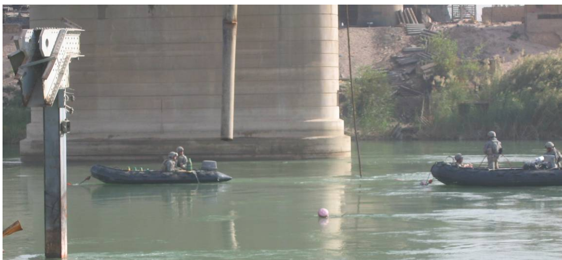
Members of 7 th Dive Lowering Shape Charges to Diver Located on Submerged Bridge

After numerous meetings with the Ministry of Construction and Housing, Iraqi Contractors, MNC-I, MNB-D and the Gulf Region Division Corps of Engineers, the 7 th Engineer Dive Team put together a plan to break the bridge section into pieces small enough for the Iraqi contractors to remove.